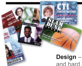
Photo ID and name badge printing services

ASAP offers a service bureau for custom card printing of your photo IDs and name badges. This is an ideal solution for organizations that cannot purchase the ID equipment or for those that would prefer to outsource this task. The process is simple: