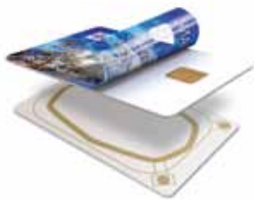
High Definition cards deliver superb image quality on smart cards. HDP Film conforms to the uneven surface created by embedded electronics.

This re-transfer technology seals the card image under the HDP Film, and provides three essential benefits for financial cards: First is over-the-edge printing, which replicates the look of pre-printed cards. Durability is second, with HDP Film protecting the printed image from rubbing off the card. And third is fraud